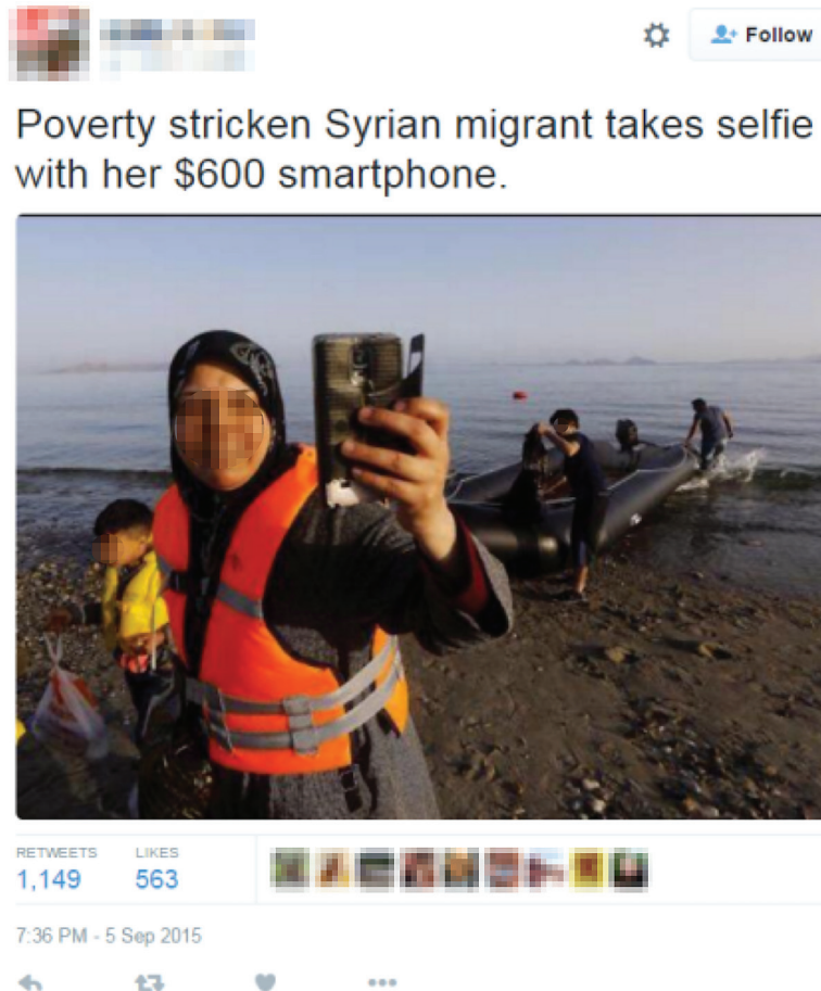
Figure 1. “Poverty stricken Syrian migrant takes selfie with her $600 smartphone” @DefendWallSt

gap in the scholarship – especially pertinent for young connected migrants – demands our attention because transnational connectedness with family members’ overseas challenges European borders and normative expectations of family governmentality as well as dominant representations of normative (white, western, middle-class) technology use. This article argues “young electronic diasporas” (ye-diasporas) (Donà, 2014) present us with a unique view on how Europe is reimagined from below, as people stake out a living across geographies. According to Donà, ye-diasporas are: